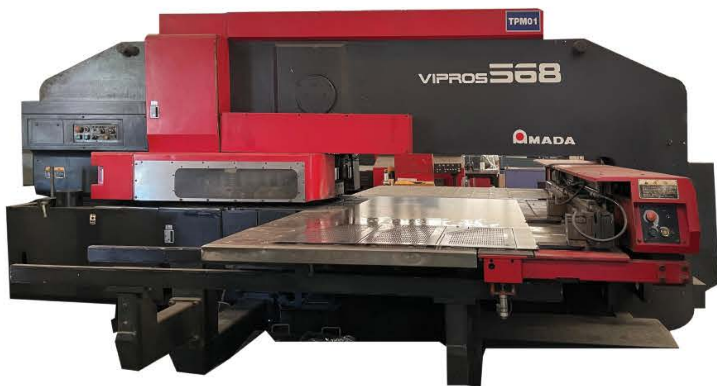
TURRET PUNCHING MACHINE