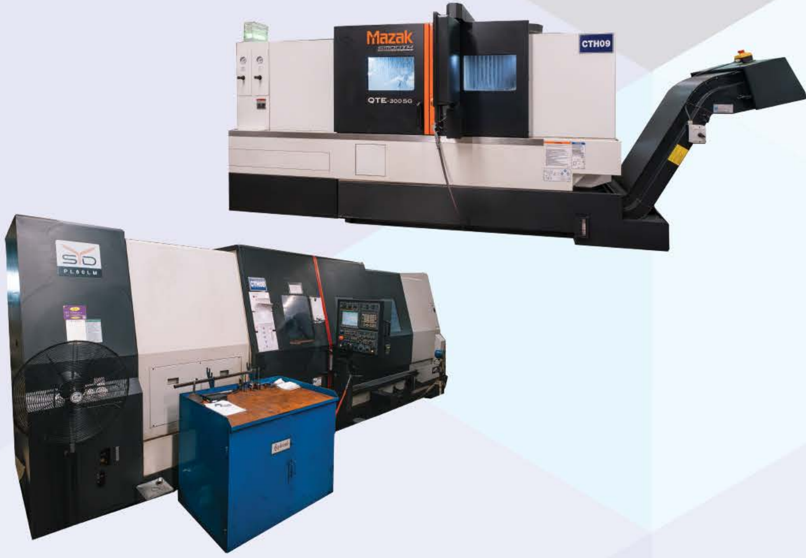
CNC HORIZONTAL LATHE TURNING CENTERS