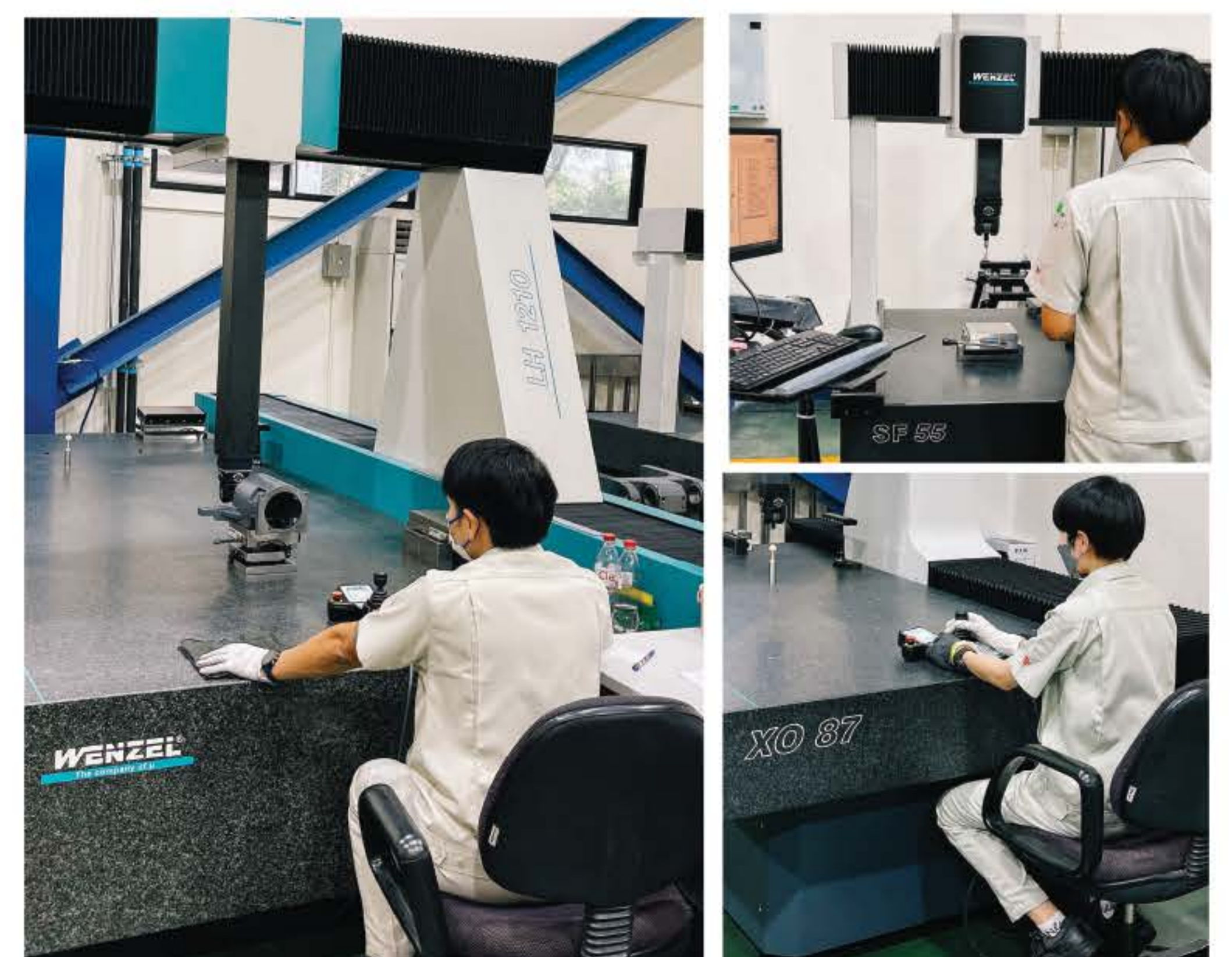
CMM (COORDINATE MEASURING MACHINE)