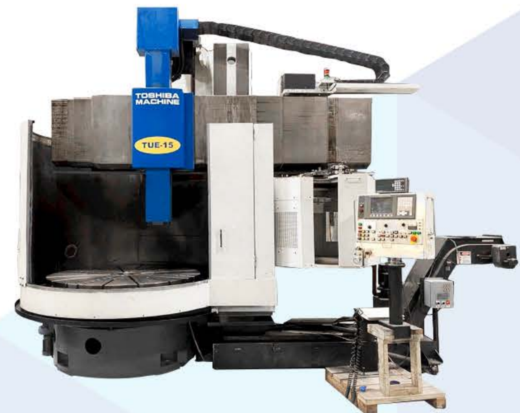
CNC VERTICAL LATHE TURNING CENTERS