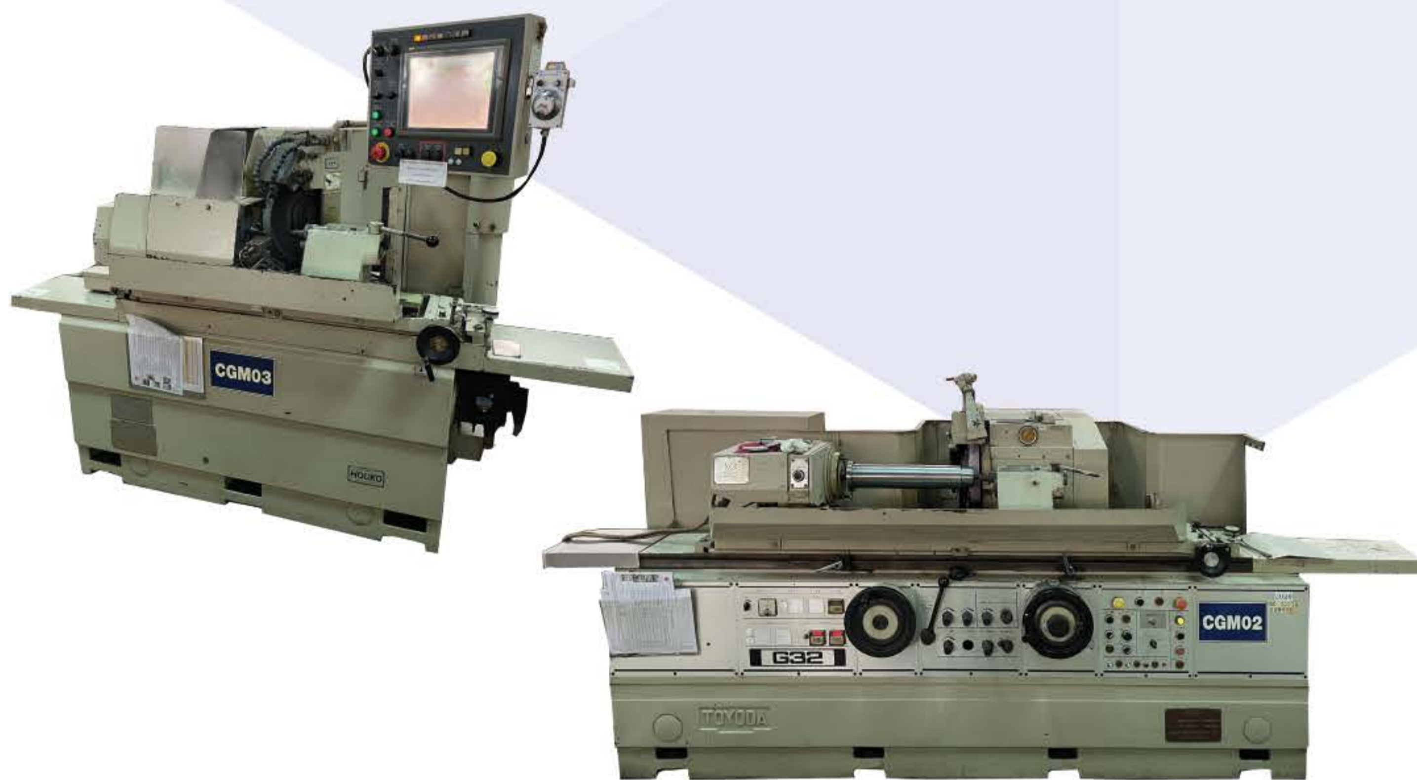
INTERNAL GRINDING MACHINE & CYLINDRICAL GRINDING MACHINE