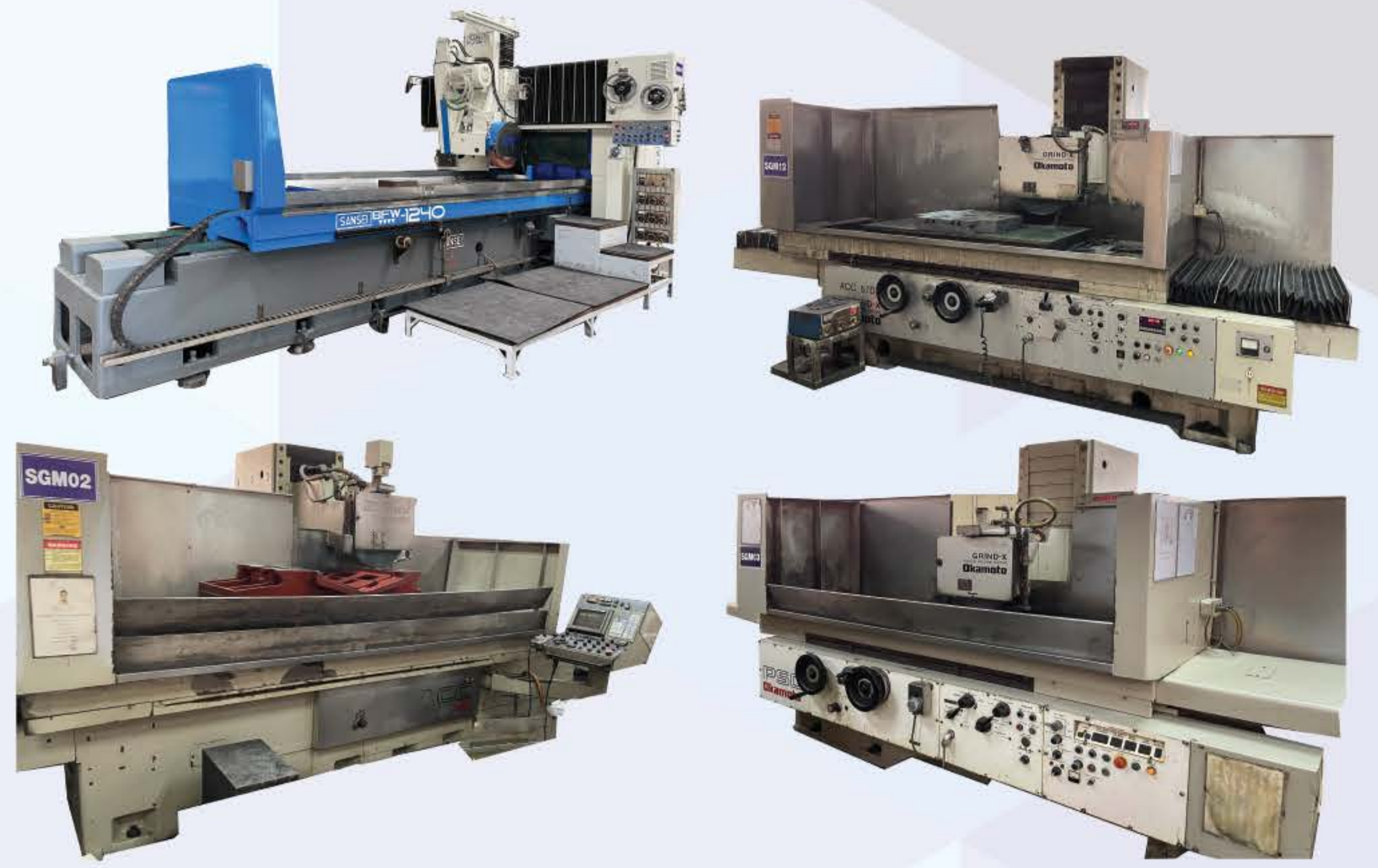
SURFACE GRINDING MACHINE