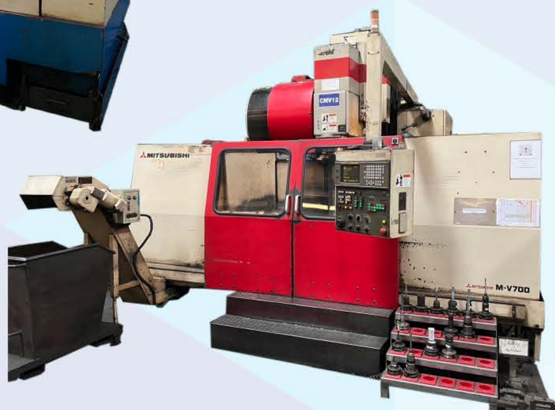
CNC VERTICAL MACHINING CENTERS