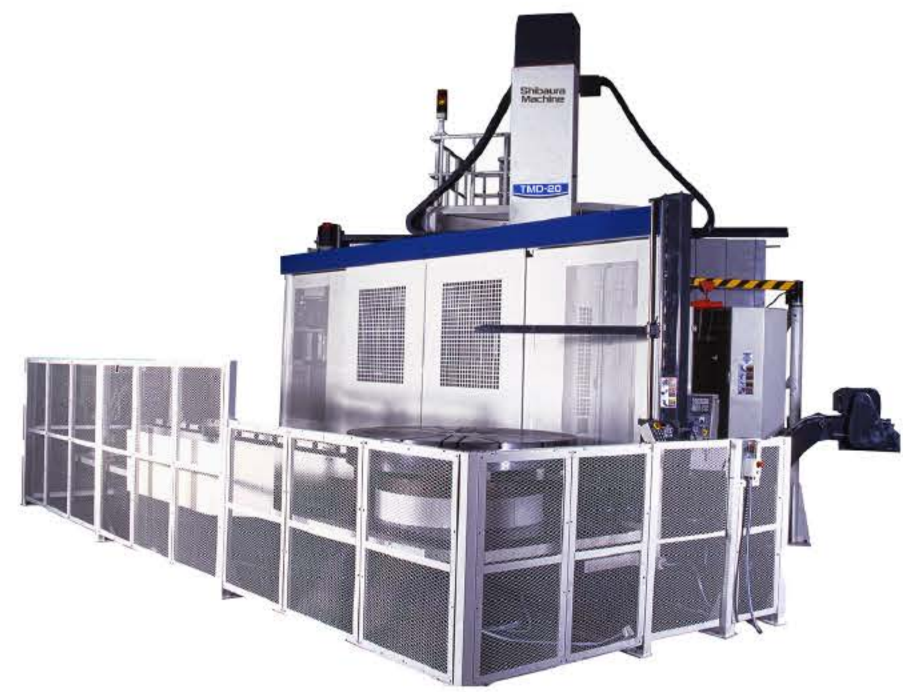
CNC VERTICAL BORING AND TURNING MILLS