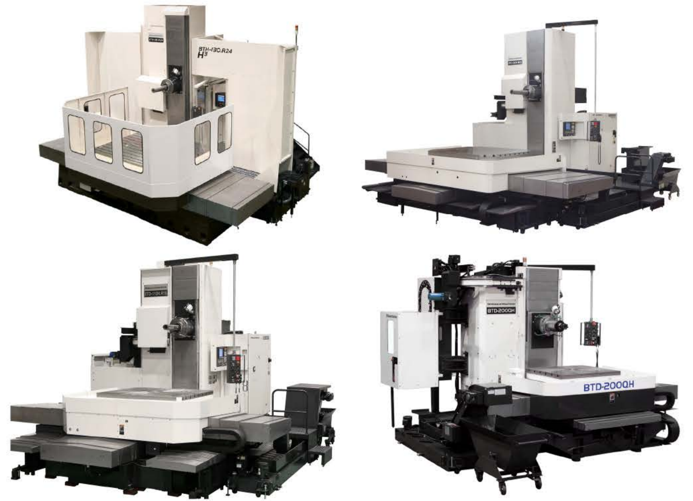
CNC BORING MACHINING CENTERS