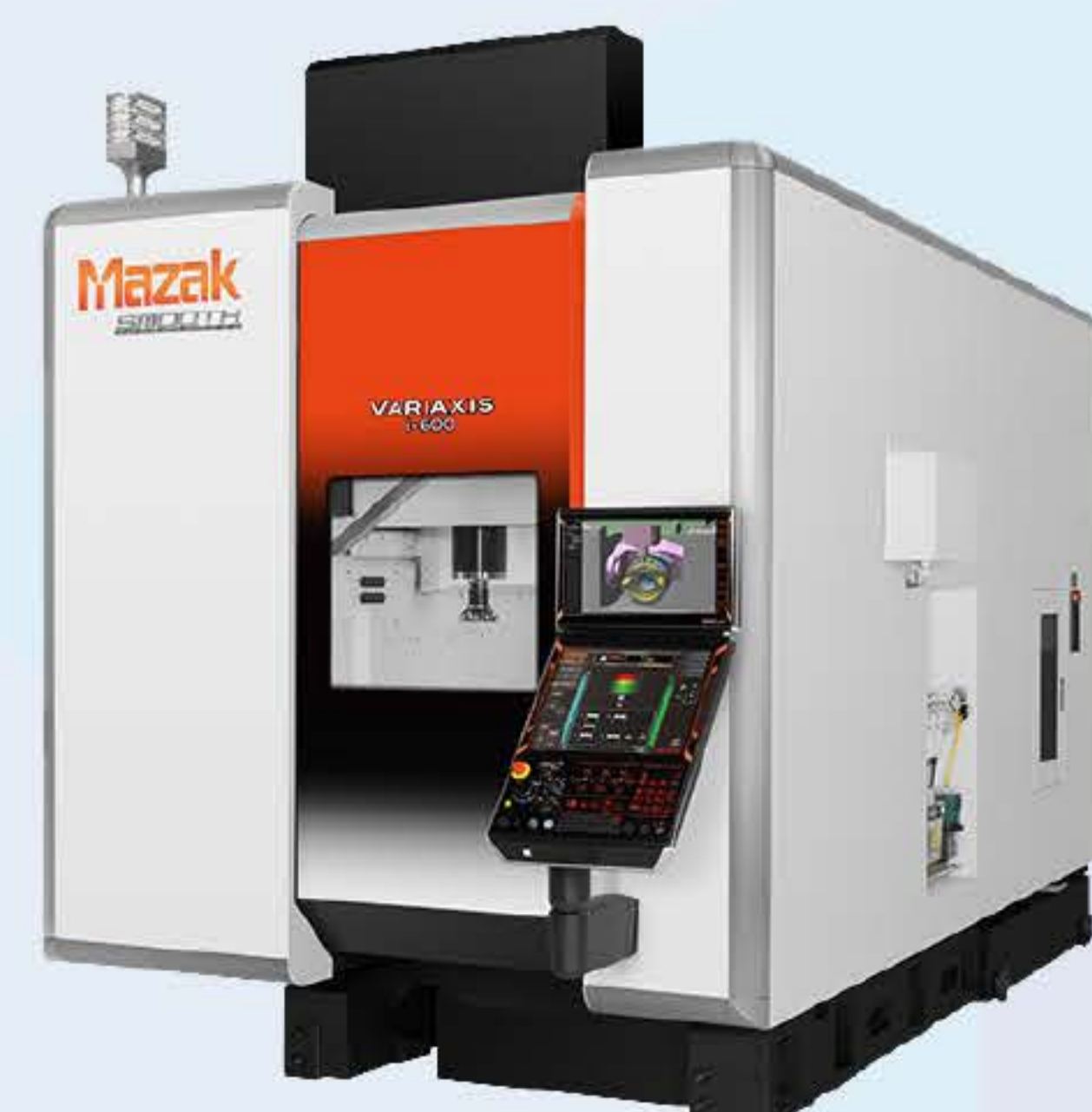
CNC 5-AXIS MACHINING CENTERS