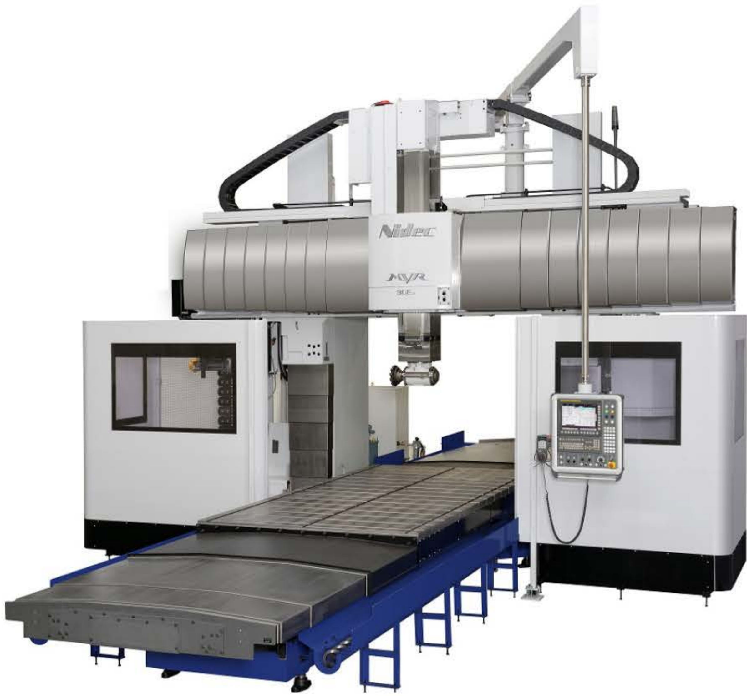
CNC DOUBLE COLUMN MACHINING CENTERS